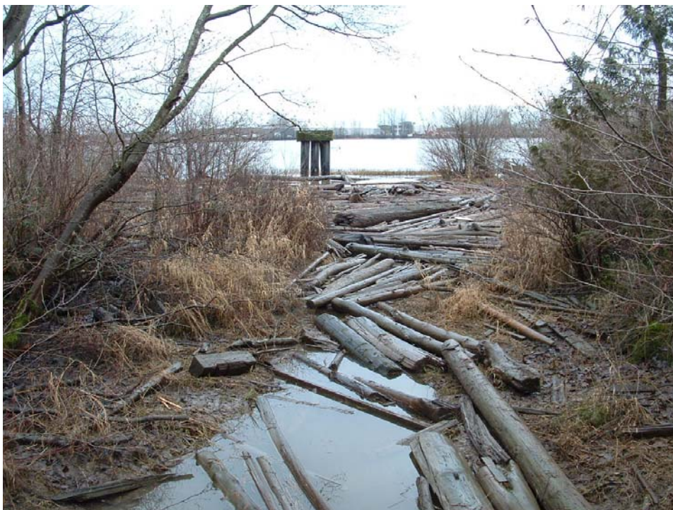
Figure 1: Industrial Woody Debris site, Mitchell island. Notice logs have no intact branches or root systems. Also note shoreline suffocation from bark (see map figure 4)