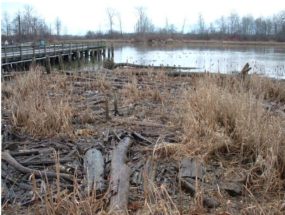
Figure 2: Industrial Woody Debris site, Fraser River Park. (see map figure 3)