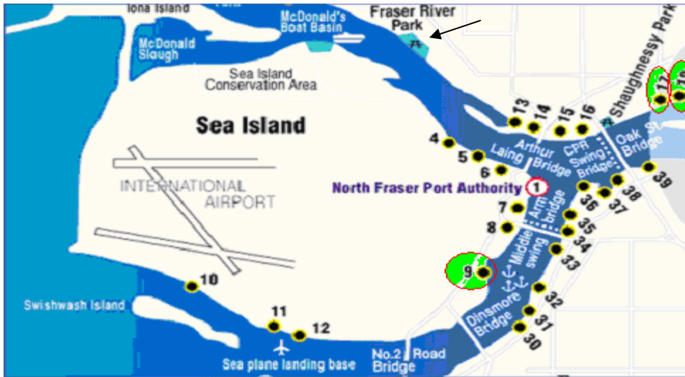
http://www.nfpa.ca/02business/02busbylocation.html North Fraser Port Authority, 2005 Figure 3: Milling sites circled in red and green. South West Vancouver area The black arrow indicates the place of figure 2