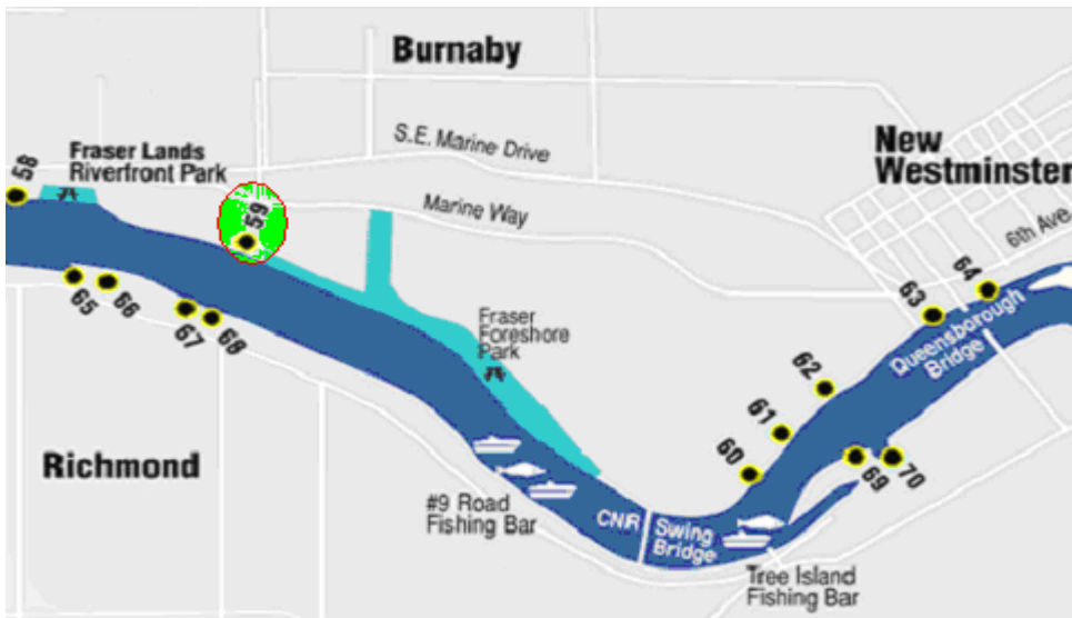
http://www.nfpa.ca/02business/02busbylocation.html North Fraser Port Authority, 2005 Figure 5: Milling sites. Burnaby, New Westminster.